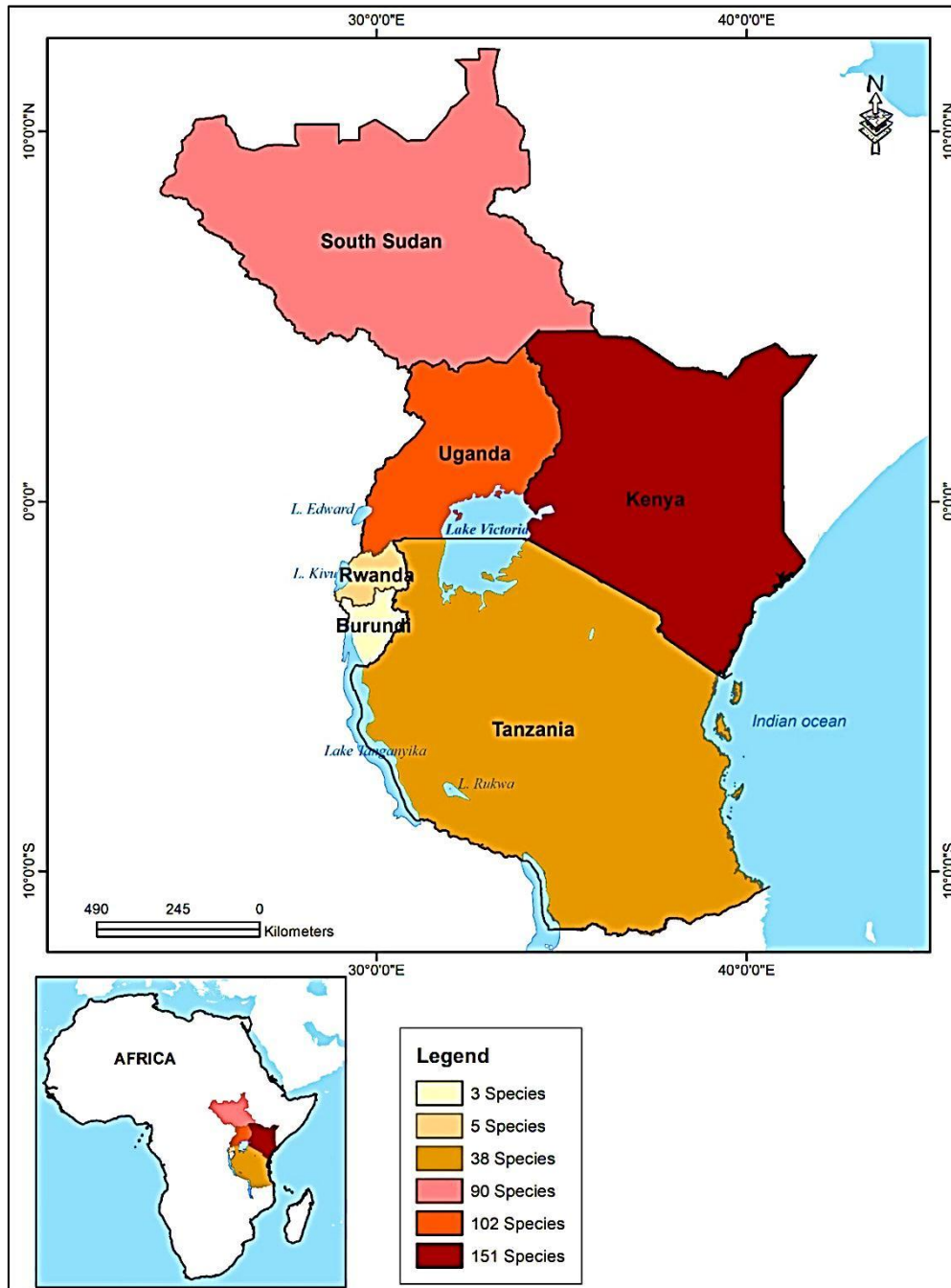
Figure 3: Distribution of arbovirus vector mosquito species across East African Countries described between 1940-2020

and Aedes such as T. pseudoconopas , Ur. alboabdominalis , T. fraseri , T. aurites and RVF virus have been isolated from Mansonia uniformis [41, 48] and from An. squamosus , Mansonia Africana , An. christyi and An. pharoensi [48, 49].